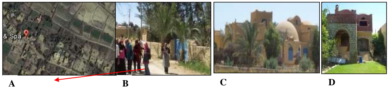
Table 1. Urban features in traditional urban pattern